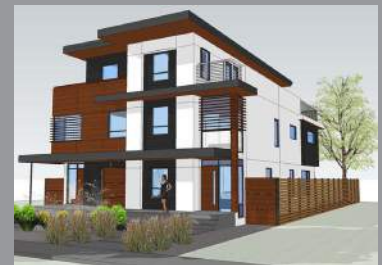
4519 Vrain St