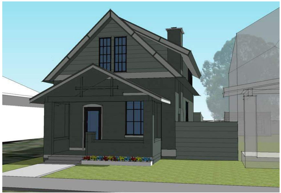
3464 W. Hayward